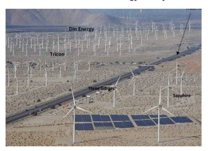
Expected Aerial View of Jhimpir Wind Corridor after completion of all projects under construction.

management. The company achieved its financial close in May 2017 and construction works completed in Sep 2018. The plant is operational since then and producing 453GWH of clean energy annually. All three wind farms will offset between 118,227-261,795 tCO2 equivalents per year. I am associated with company for over last 4 years and enjoyed steady career progression and now progressed to Assistant Manager level. Currently the renewable sector attracts robust growth with over 12 projects only in wind sector alone under construction and given the fact it's on top of government 's priority list to increase renewable share to 30% in energy mix by 2030.