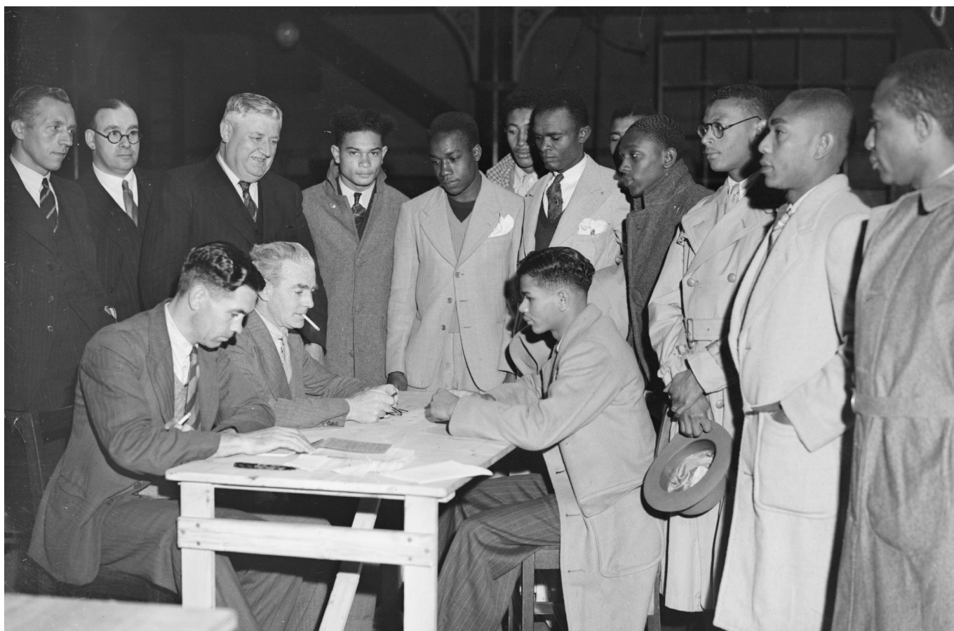
Caribbean migrants registering for employment

(Climbing Up the Rough Side of the Mountain Page 251)