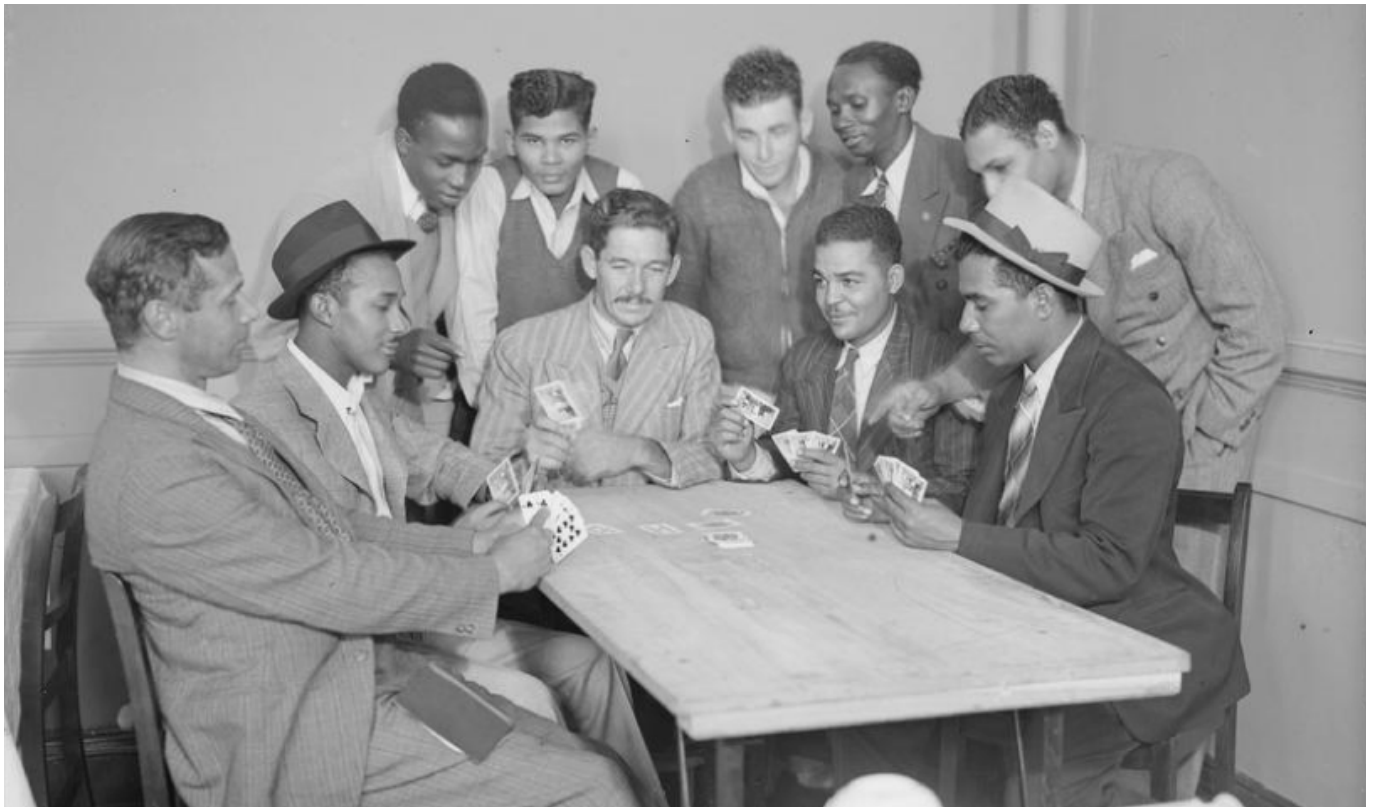
Caribbean migrants playing cards

Do they hold similar views to your learners or bring new perspectives on the issues?