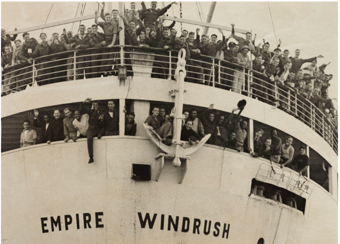
The Empire Windrush arrives in the London Dock at Tilbury

The ship Empire Windrush docked at Tilbury in Essex on 22nd June 1948 carrying more than 500 Caribbean migrants. The ship had been used by the Nazis in the Second World War to carry troops before being taken by Allied forces in May 1945 and refitted by the British for civilian use. During the Second World War thousands of men and women from British colonies in the Caribbean fought for the allies and the ship was in the Caribbean because it was picking up servicemen and women who had been there on leave. The passengers aboard the Windrush also included men, women and children from the Caribbean with a diverse heritage including those from Chinese, Maltese and Polish descent and some stowaways.