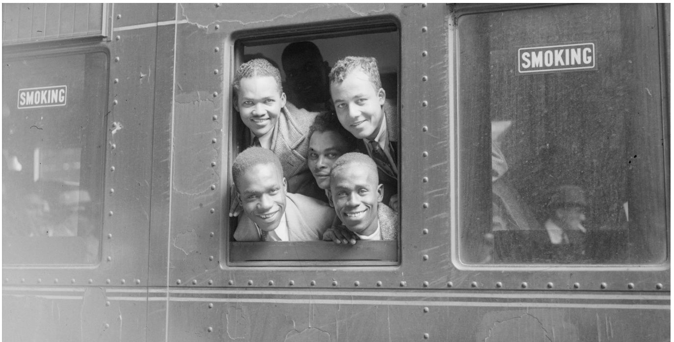
Caribbean migrants en route to from London to Liverpool

The poem also contains a line reminding the child to think of his Grandmother back in Jamaica and to write a letter about his Windrush adventure. Ask your pupils to discuss what they think he would write in that letter and draft it.