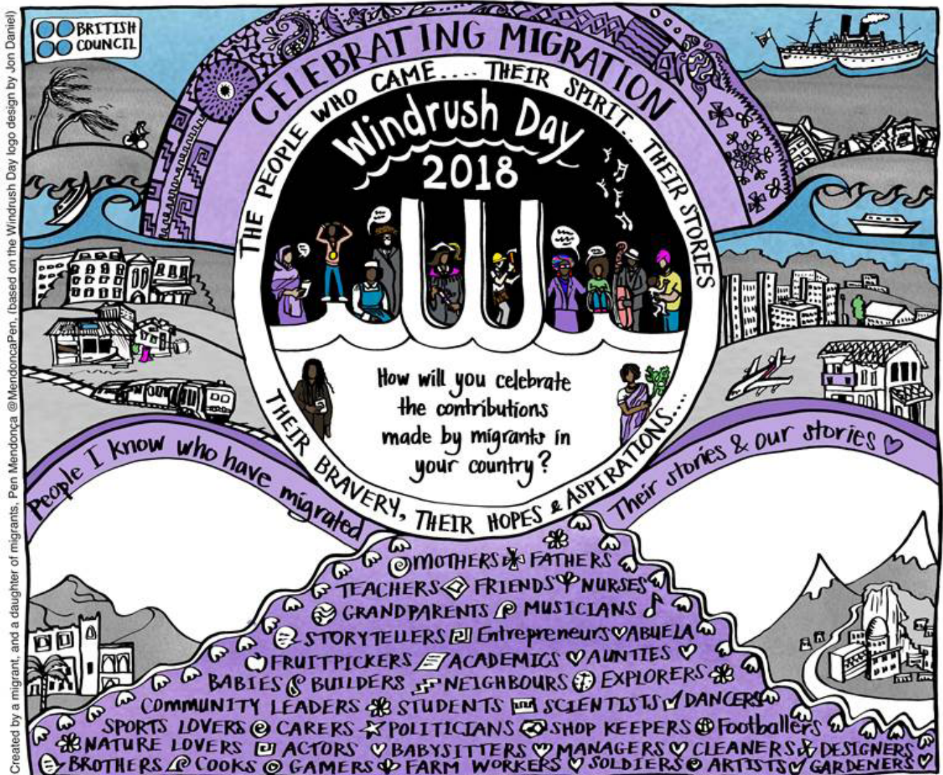
Graphic by @MendoncaPen www.penmendonca.com

Show your pupils the banner designed by Pen Mendonca to celebrate the stories of migrants – their spirit and their bravery, their expectations, hopes and aspirations. The designs within the top arch are from South America, Pacifica, Asia, north and west and Africa.