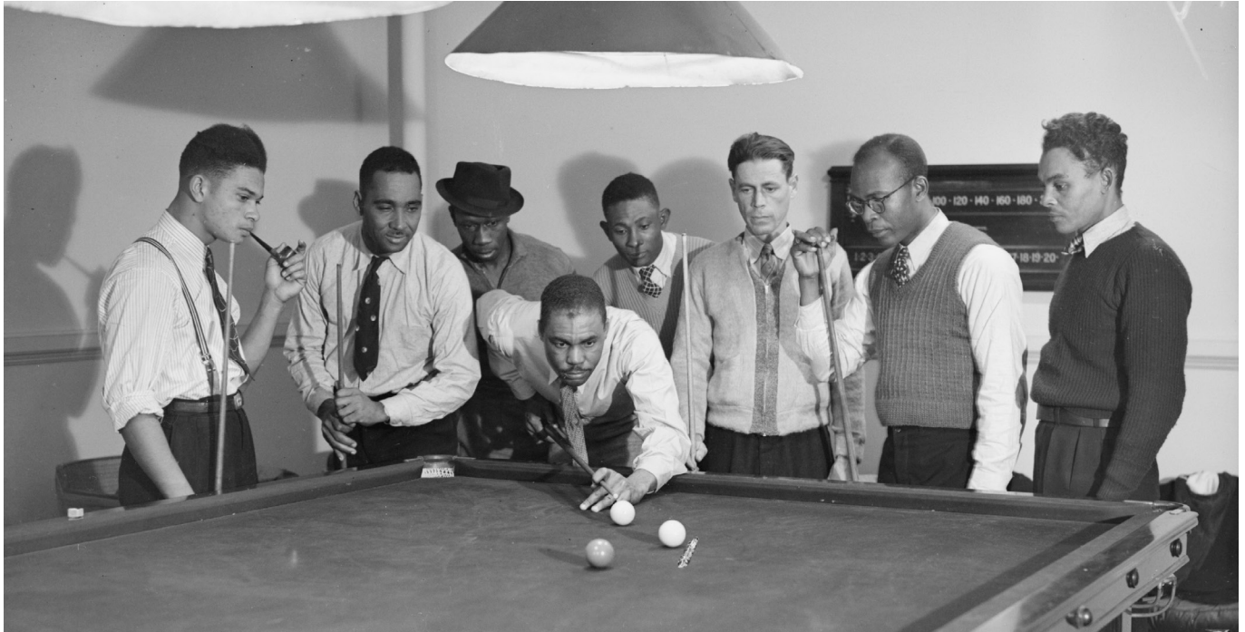
Caribbean migrants playing snooker