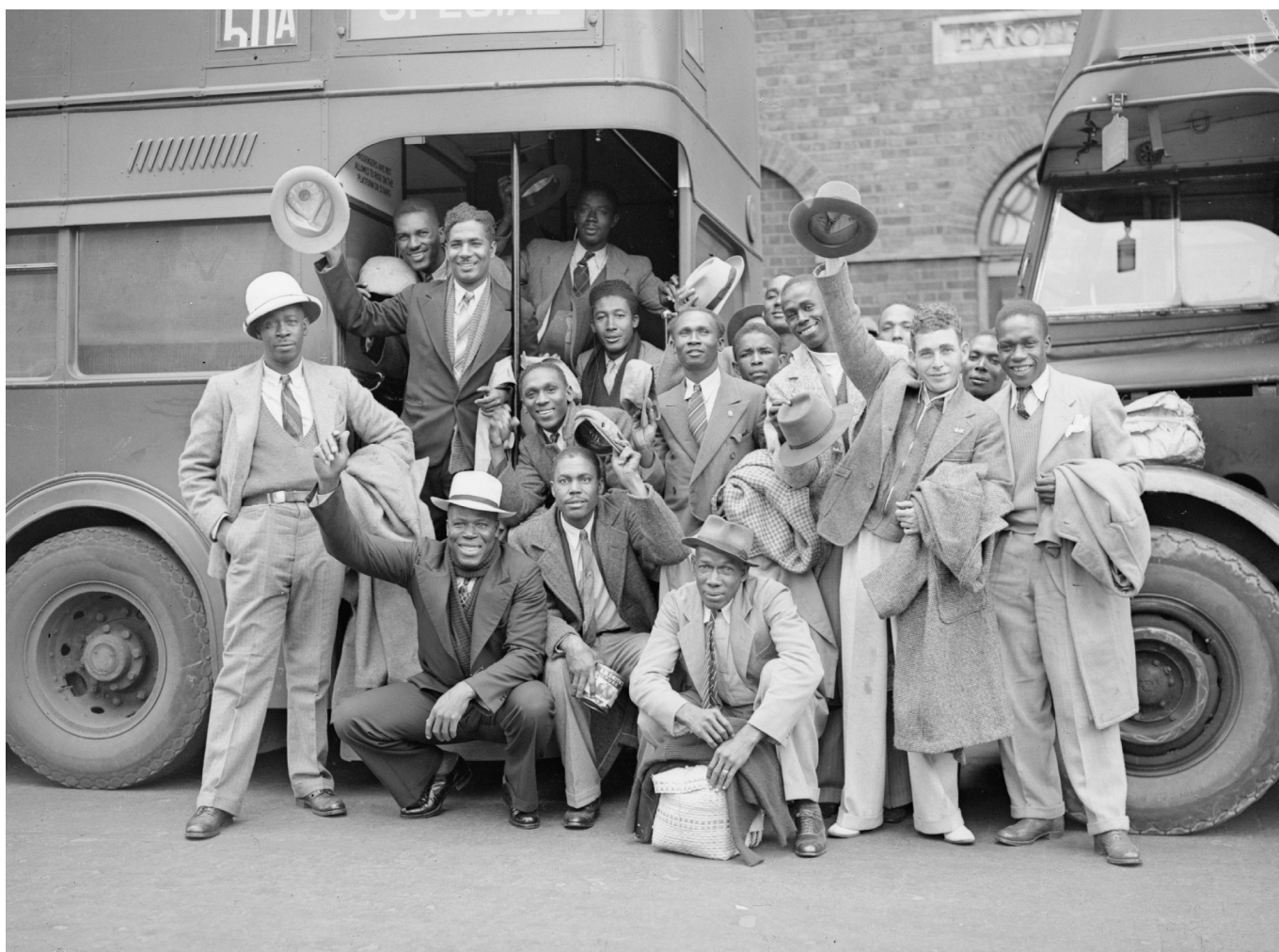
Caribbean migrants with London buses. Many of the Windrush travellers found employment on London's transport system.

When the new migrants arrived in Britain from the Caribbean, it was relatively easy for them to get unskilled jobs, but hard to find somewhere to live because of a great housing shortage, after the war. They found harsh conditions where they were often poorly treated.