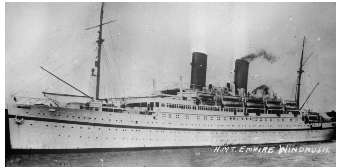
The Empire Windrush

The pack contains background information, ideas for discussion, and cross-curricular activities. There are links to curriculum subjects, core skills and Commonwealth values, along with suggestions of activities that you might carry out with your class or in collaboration with a partner school overseas. The activities can be used as starting points for individual lessons or as elements of larger cross-curricular joint projects to develop knowledge and understanding, alongside important skills and competencies, essential for young people growing up as twenty first century global citizens.