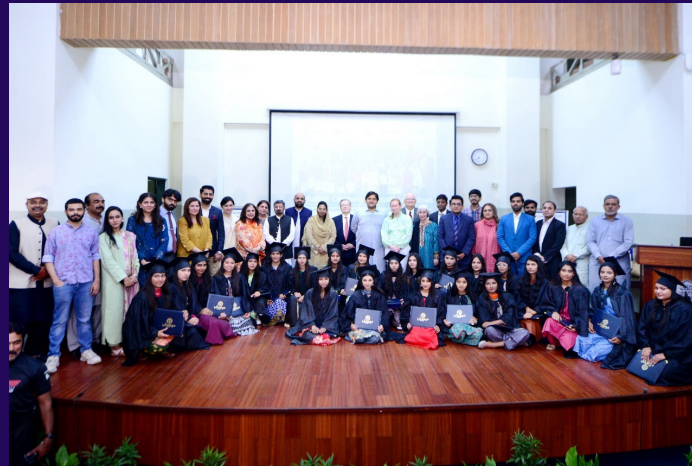
Group photo of the fellows with dignitaries at the graduation ceremony