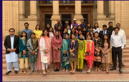
Fellows during their Punjab Assembly exposure visit