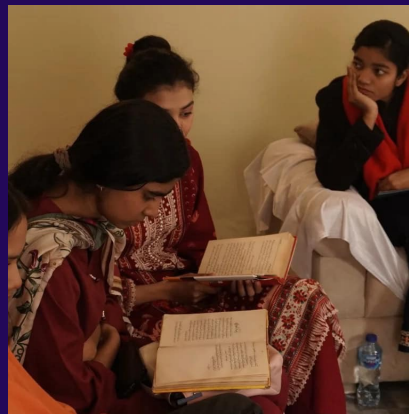
Fellows studying in a library setting

Reflections: Lessons Learned and Challenges Faced