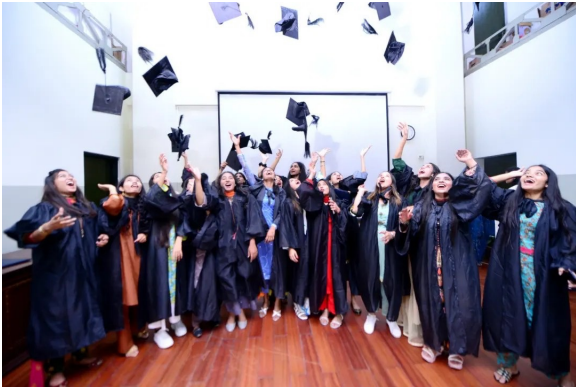
Prosperity Fellows on the day of their graduation: May 31, 2024

Breaking the boundaries to further education and employment among Dalit Minority girls whose communities are stuck in descent-based menial occupations (mainly sanitation) in Lahore (Punjab, Pakistan)