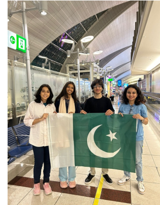
Fellow representing Pakistan in Russia