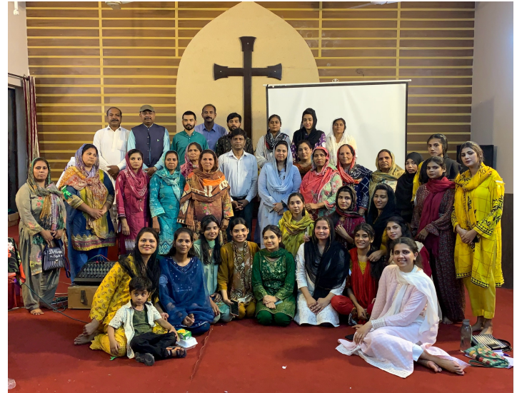
Fellows in a community outreach programme