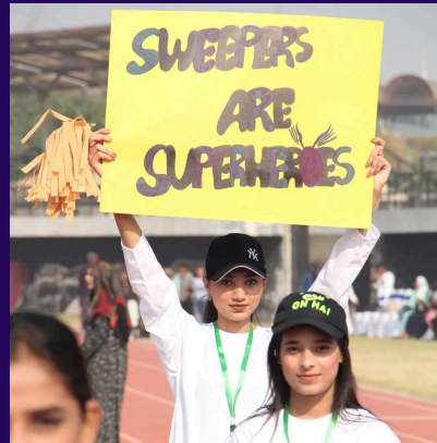
Fellow holding a placard during sports gala