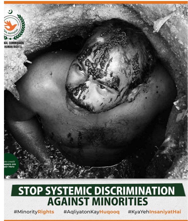
Sanitation Shafiq Masih in a manhole