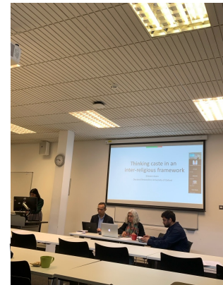
Workshop at Lancaster