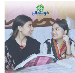
Advertisement for outreach