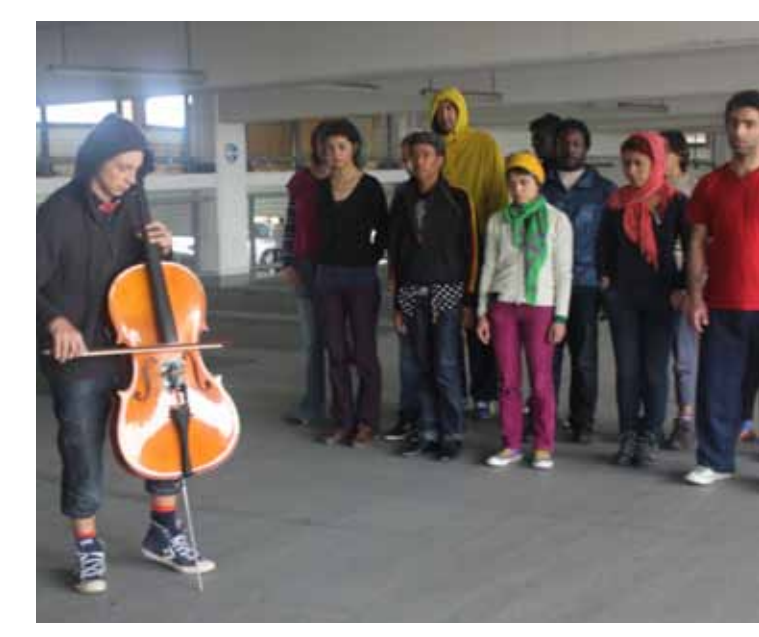
A collaboration between London International Festival of Theatre and young performers in Tehran.

Art continues to flourish in Iran, with a strong two-way appreciation and profound interest between UK and Iranian artists. We facilitate platforms for the manifestation of this shared interest through promoting understanding of the different arts sectors in both countries; we do this by enhancing communication and the exchange of knowledge, supporting processled projects, and encouraging collaboration. Working with partners across the Arts sector, this year we are focusing on the four disciplines of visual arts, music, theatre, and literature.