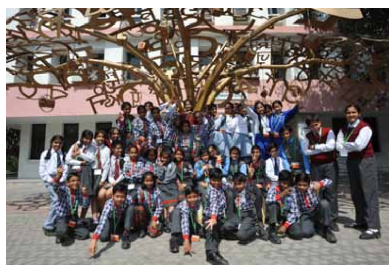
Students at National Council Of Educational Research and Training during an Arts Education Project, Delhi.

A new long-term engagement in the Arts is being planned through Re-Imagine, involving a range of Indian and UK partners. This is expected to change the nature and scale of creative collaboration between the two countries and will build on the successful showcases presented in 2013. Homelands, the largest exhibition of work from the British Council Collection, has toured to four Indian cities and the first