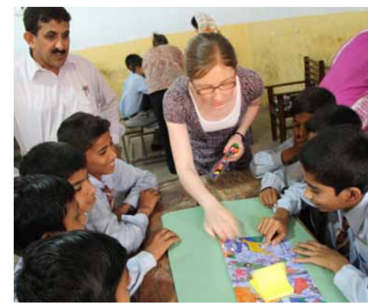
School teacher from the UK teaching in a Pakistani classroom as part of an exchange visit under the Connecting Classrooms programme.

We are also bringing UK qualifications to Pakistan and over the last three years we have seen steady growth in the delivery of UK exams, which now stand around 420,000 per annum.