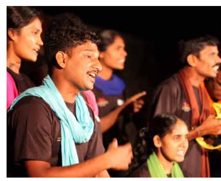
Performance by British Council's Forum Theatre group 'Shakthi' comprising young Sinhalese and Tamil people emerging from post-conflict communities in Sri Lanka.

Our office premises in Colombo are currently being refurbished following a major investment to upgrade our services and facilities. We will also be opening a new branch in Jaffna at the end of 2013.