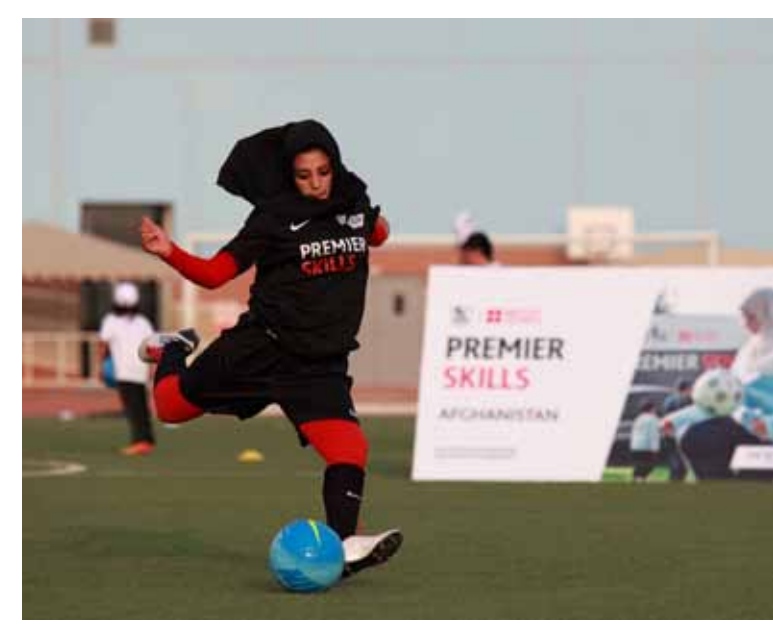
In July 2013 twenty Afghan Premier League coaches received football and community development skills training as part of the Premier Skills training programme.

We will look to help strengthen a democratic and tolerant space in the Arts, and promote a voice for Afghan Art and artists. Programmes will provide skills and professional development to young Afghan Arts leaders and practitioners and Arts will be used to help peaceful resolution of conflicts and promote freedom of expression.